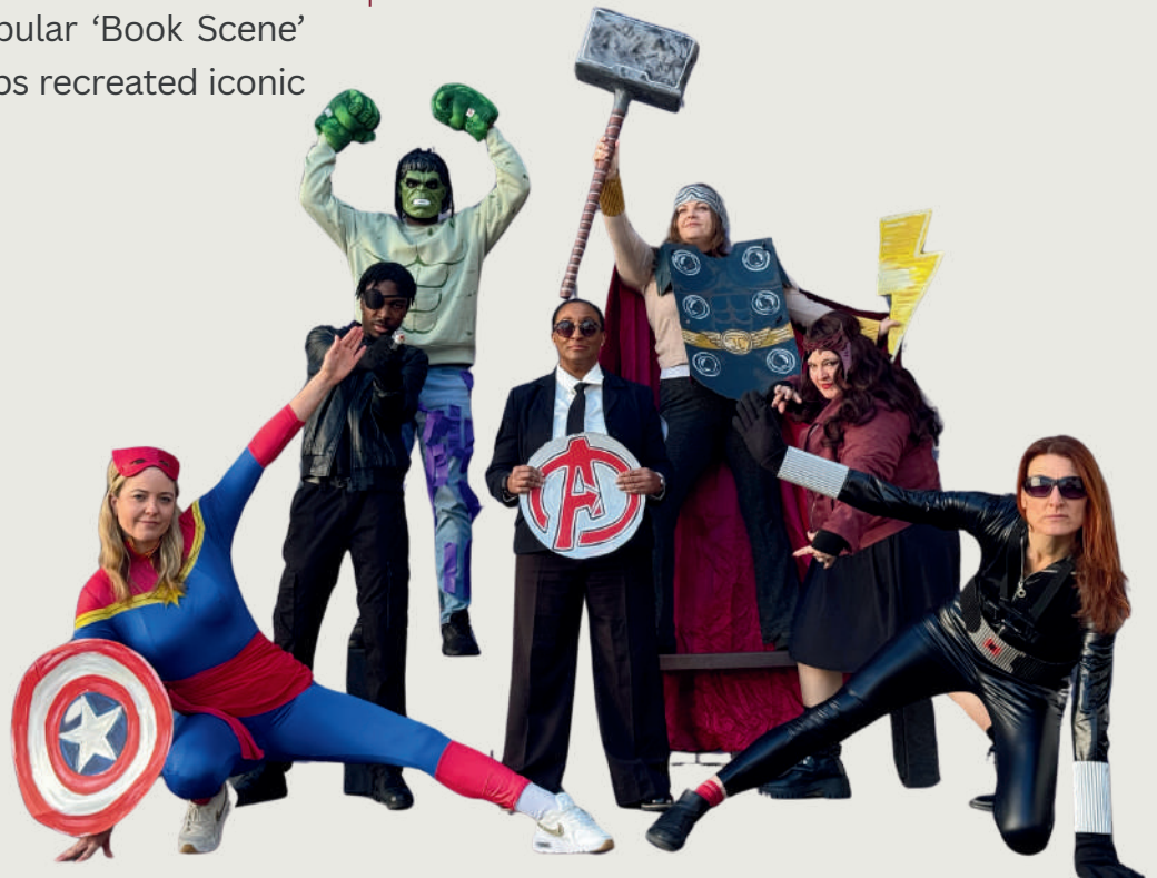
The winning staff team - Creative Tech!

World Book Day was a resounding success, reinforcing the joy and importance of reading within our school community. Thank you to all staff and students for their enthusiasm and creativity in making the day so memorable.